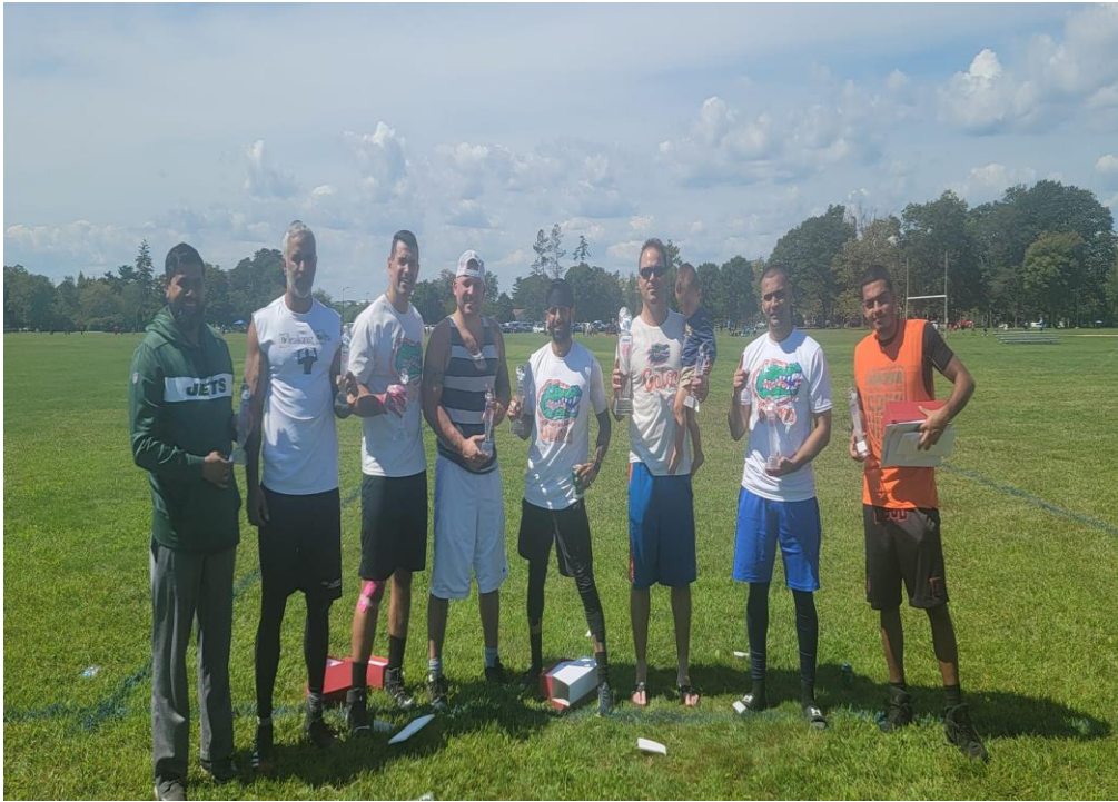
ABOVE: THE GATORS AFTER WINNING THEIR FIRST TITLE IN FRANCHISE HISTORY